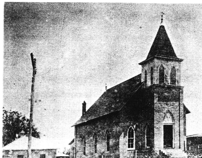
Brooksville Baptist Church c. 1908

for some time. 5 Then materials were so slow in arriving that Jennings had to inquire as to their whereabouts. But he received no clear explanation for the delay. 6 At last, on November 1899, the building committee applied for and received permission from the city commission to construct a 30x40 foot building, containing an 8x20 foot vestibule and a 10x20 foot room at the rear. It was to be of frame construction with brick veneer and a metal roof. 7