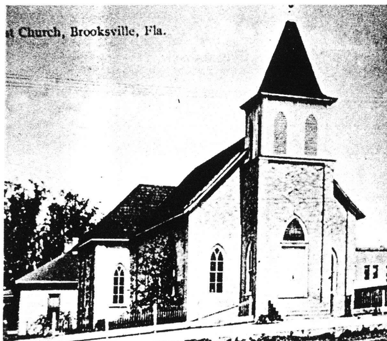
Brooksville Baptist Church c. 1920

had recently become the new pastor. In any event, accommodations were so tight that a three classroom addition to the church was added in 1927. 9 The membership continued to rise reaching 577 in 1952. 10 Presently, the church occupies a relatively new group of buildings on Howell Avenue having moved there in the early 1970's.