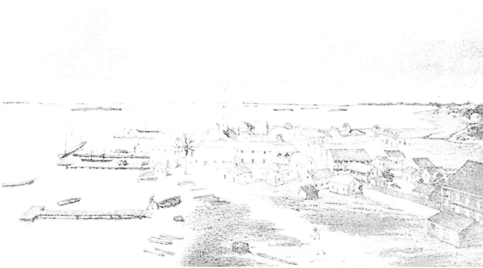
W.A.Whitehead sketch of Key West, June 1938